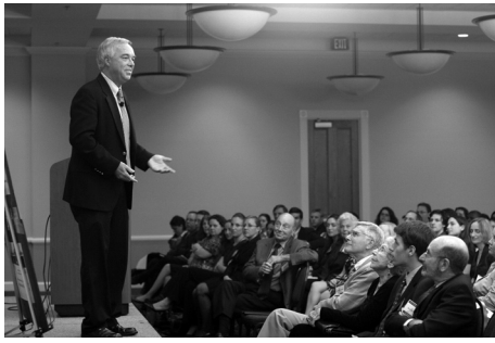
USA Today Editor Ken Paulson delivered the Sept. 20 keynote address at the Summit.