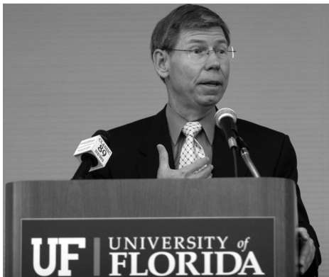
Florida Attorney General Bill McCollum delivered the keynote speech during the awards luncheon Friday. McCollum discussed the new Government Accountability Project (GAP).